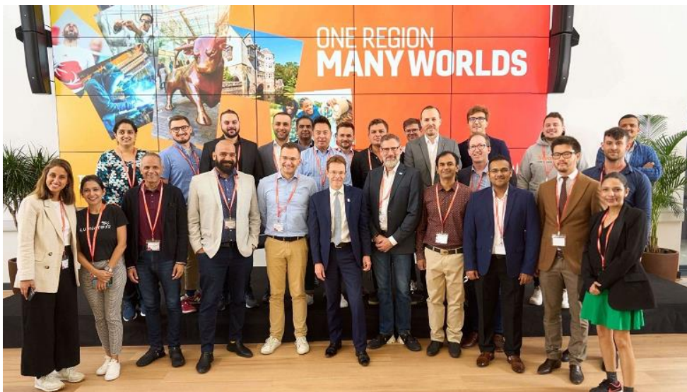
2022 Scale Up Games finalists with Andy Street, Mayor of the West Midlands

The West Midlands One region, many worlds